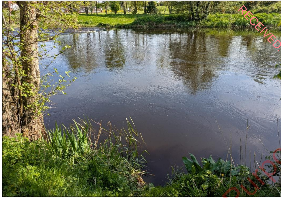
FIGURE 12. OUTFLOW POINT OF WHITEHALL STREAM INTO RIVER BOYNE APPROXIMATELY 750M DOWNSTREAM OF PROPOSED DEVELOPMENT SITE.