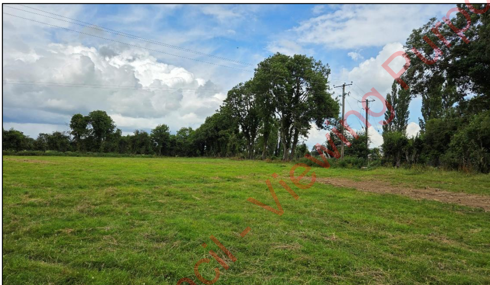
FIGURE 1. PROPOSED DEVELOPMENT SITE (LOOKING NORTH).

The proposed development site is located in the north-eastern section of Trim town, situated south of the R154 Athboy Road in the townlands of Crowpark and Corporationland. The site comprises three agricultural fields and associated boundary hedgerows and ditches, with the Whitehall Stream flowing through the site. The proposed development broadly comprises the construction of 85no. residential units and associated works.