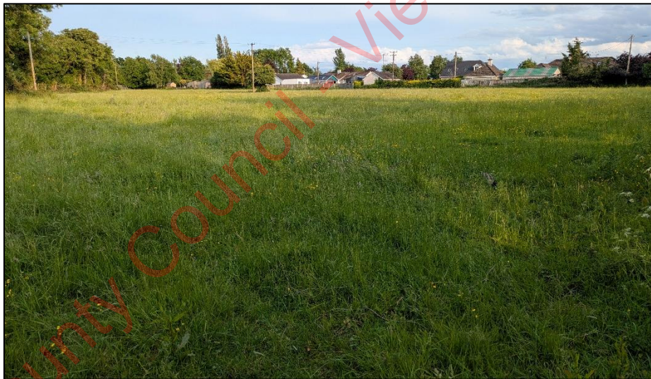
FIGURE 8. AGRICULTURAL GRASSLAND WITHIN PROPOSED DEVELOPMENT SITE (LOOKING EAST).

The proposed development comprises almost entirely improved agricultural grassland (GA1) , currently utilised for cattle grazing. This habitat grades to dry meadows and grassy verges (GS2) in some areas, particularly along the field edges. Grass species recorded within the agricultural fields include perennial ryegrass, cock's foot, Yorkshire fog, crested dog's tail, sweet vernal grass, creeping bent and meadow foxtail. The herbaceous component is dominated by meadow buttercup and creeping buttercup. Other species recorded include white clover, nettle, docks, ragwort, daisy and germander speedwell, with some infrequent small patches of soft rush in places. Cow parsley, hedge mustard and herb Robert were also noted close to field edges.