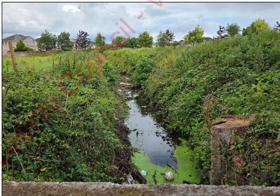
FIGURE 10. WHITEHALL STREAM WITHIN PROPOSED DEVELOPMENT SITE.

The Whitehall Stream flows through the northern section of the proposed development site. This is classified as a lowland / depositing river (FW2) . There is no remaining established riparian habitat along this section of the stream. The stream is heavily modified, emerging from a culvert under the Belfy residential development, and entering a submerged culvert/drain under a farm access track into adjacent property.