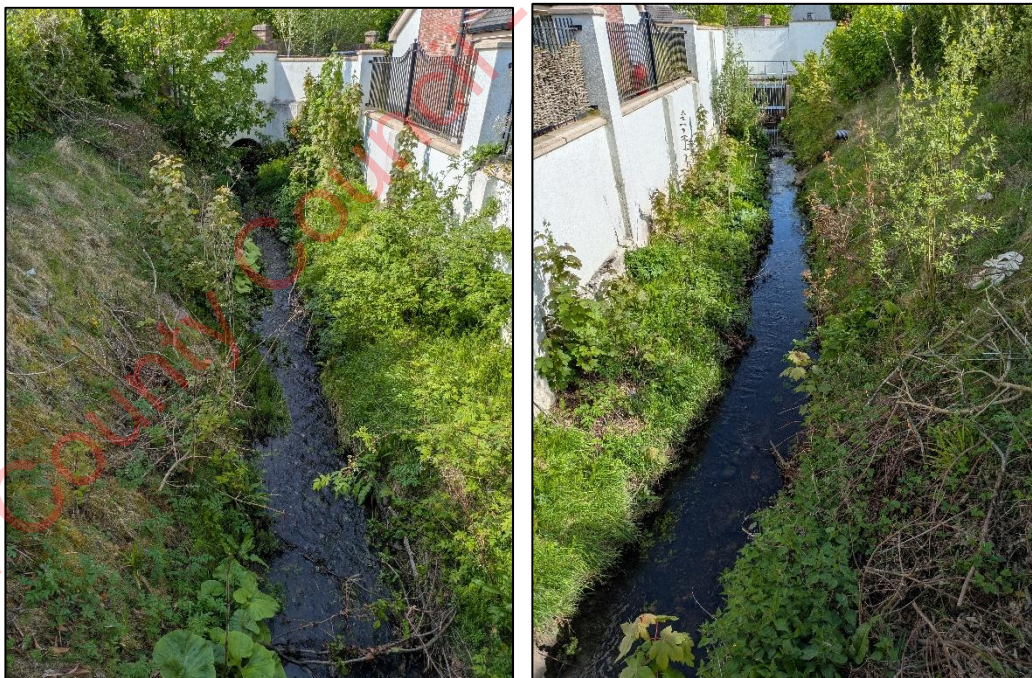
FIGURE 11. WHITEHALL STREAM AS IT FLOWS THROUGH BUTTERSTREAM RESIDENTIAL DEVELOPMENT IN OPEN CHANNEL FOR APPROXIMATELY 50M.

There is a short (c.50m) section of open channel adjacent to residential properties in Butterstream Manor, where the stream is again culverted and remains culverted until shortly before it outflows into the River Boyne approximately 750m downstream of the proposed development site.