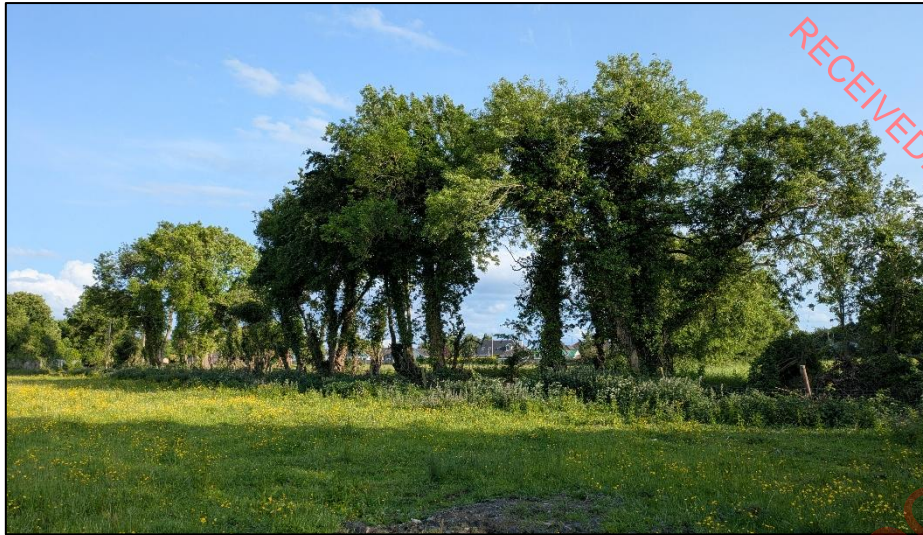
FIGURE 9. HEDGEROW CROSSING CENTRE OF PROPOSED DEVELOPMENT SITE.

The Whitehall Stream flows through the northern section of the proposed development site. This is classified as a lowland / depositing river (FW2) . There is no remaining established riparian habitat along this section of the stream. The stream is heavily modified, emerging from a culvert under the Belfy residential development, and entering a submerged culvert/drain under a farm access track into adjacent property.